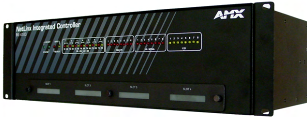
FIG. 1 NI-4100 NetLinX Integrated Controller (front view)

For more detailed installation, configuration, programming, file transfer, and operating instructions, refer to the NetLinX Integrated Controllers (NI-2100, NI-3100, and NI-4100 Series) Instruction Manual, available online at www.amx.com .